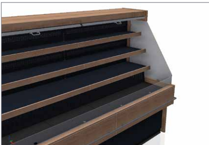
Flexible shelf set-up