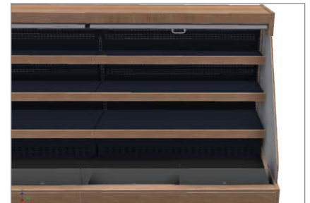
Night cover curtain (optional)